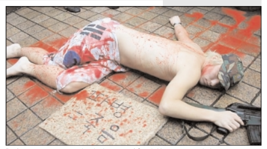
Performance to oppose the deployment of South Korean troops in Iraq, Seoul, October 1, 2003

recognized conscientious objection of Jehovah's Witnesses. On 23 July, 1985, and 14 September, 1992, the court ruled against COs and the decisions repeat the phrase of 22 July, 1969. What is perplexing is that those decisions do not state why conscientious objection does not fall into the category of freedom of religion and conscience.