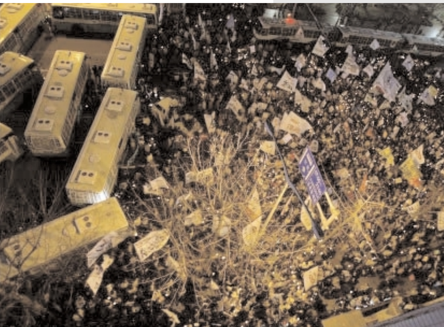
Candlelight demonstration against war on Iraq in Seoul, 20 March 2003

66 Heigidong Dongdaemungu, Seoul 130-050 tel +82-2-966 0072 email paullee64@hanmail.net http://www.kuc.or.kr